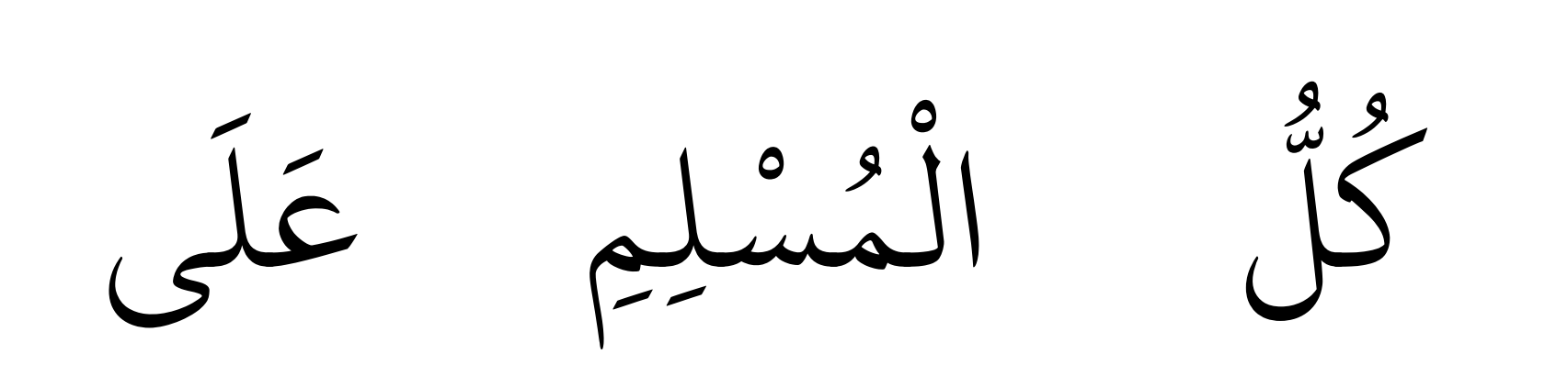
upon the Muslim Every